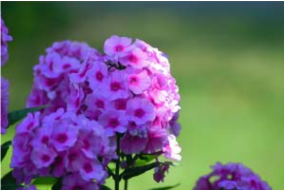
Beautiful hydrangeas are seen in bloom throughout the Mount Baker area this time of year.