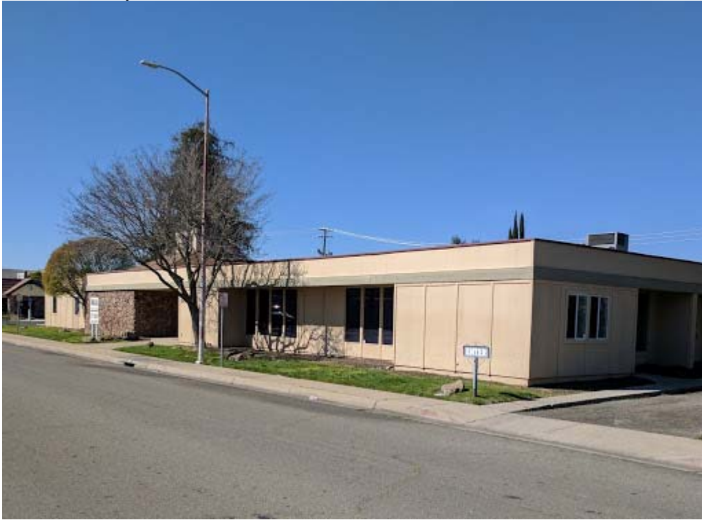
860 Plaza Way-