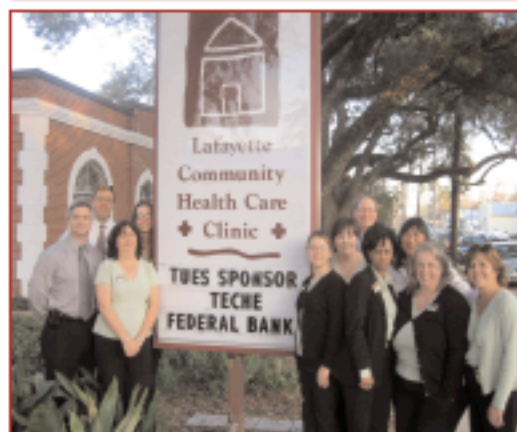
Sponsor-A-Clinic-Night invites you to fund the operational costs to run the clinic for one evening!