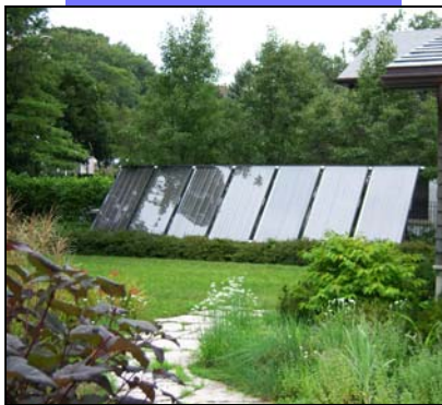
Several 4'x8' hot water solar collectors installed along the driveway provide much of the heat for the radiant-floor heating system.